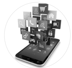
Wafer Level Test