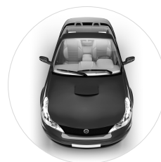
Power / Sensor