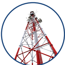
RF / Analog